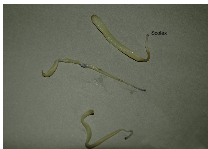
[Table/Fig-1]: Head end of tape worm

The prevalence of Taeniasis in the tropical zones is high. Most of the patients ended up with severe surgical complications with a high morbidity and mortality [3]. The incidental presence of tapeworms in