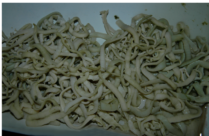
[Table/Fig-2]: Extracted tape worms